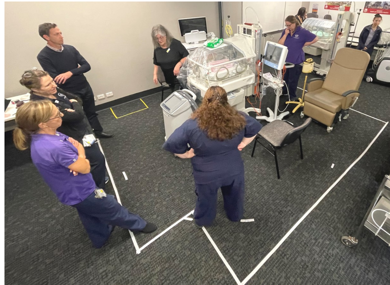
Members of the NICU and redevelopment project teams tested how the proposed layout will work in practice