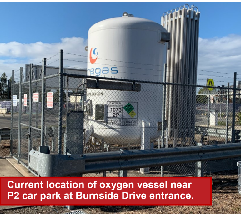
Current location of oxygen vessel near P2 car park at Burnside Drive entrance.