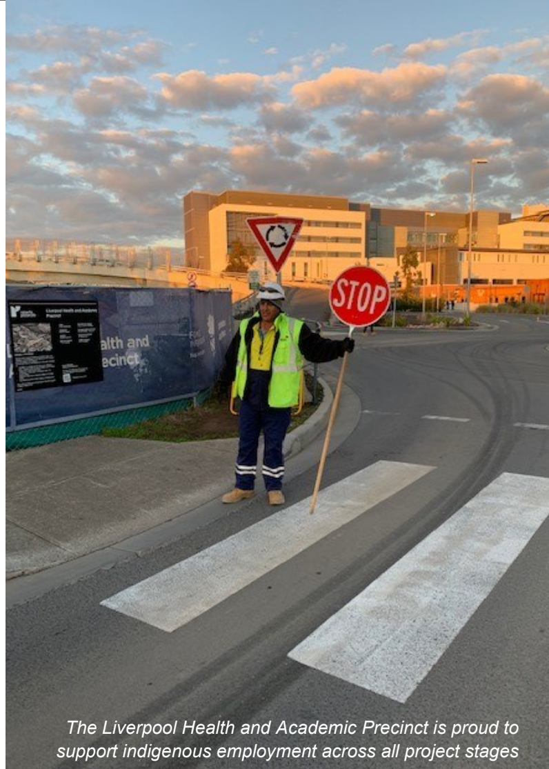
The Liverpool Health and Academic Precinct is proud to support indigenous employment across all project stages

In recognition of NAIDOC Week, which would usually be celebrated nationally in July, we acknowledge the valuable contribution Aboriginal and Torres Strait Islander community members and businesses are making to our project.