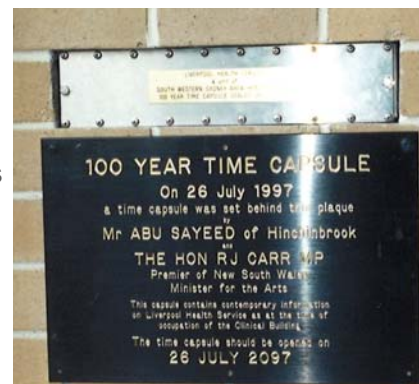
The time capsule was created in 1997 and will be opened in July 2097.