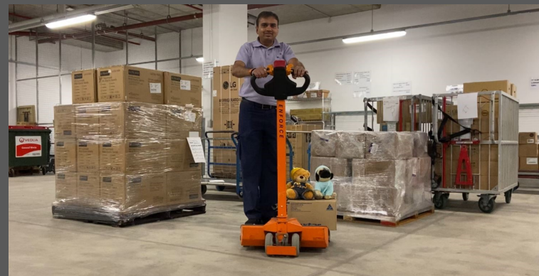
Our Distribution Centre team has quickly adapted to their new space, which they'll operate out of for the duration of the project until their future home is completed.