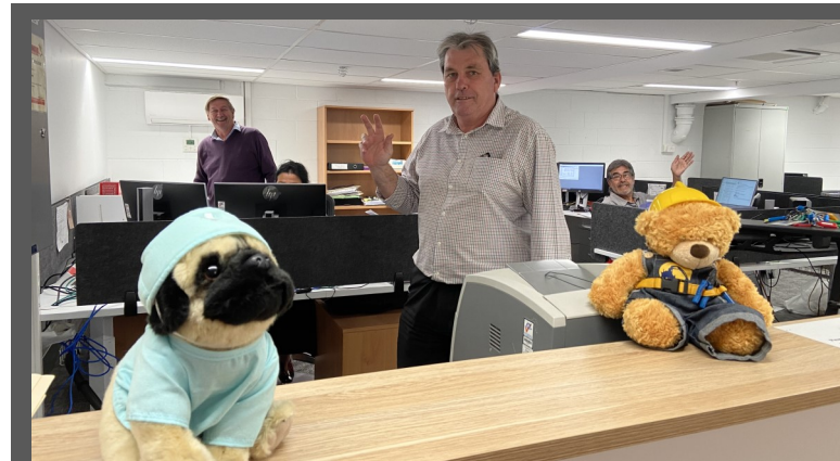
Engineering Services recently moved into their temporary home on the Elizabeth Street side of the P1 basement car park to enable the P1 and P3 car parks to be connected as part of early works.

It's been a busy month of services on the move and construction works, and our project mascots Toolman Ted and Scrubs the Pug recently got out and about to check out what all the fuss is about!