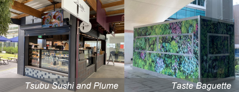
Tsubu Sushi and Plume