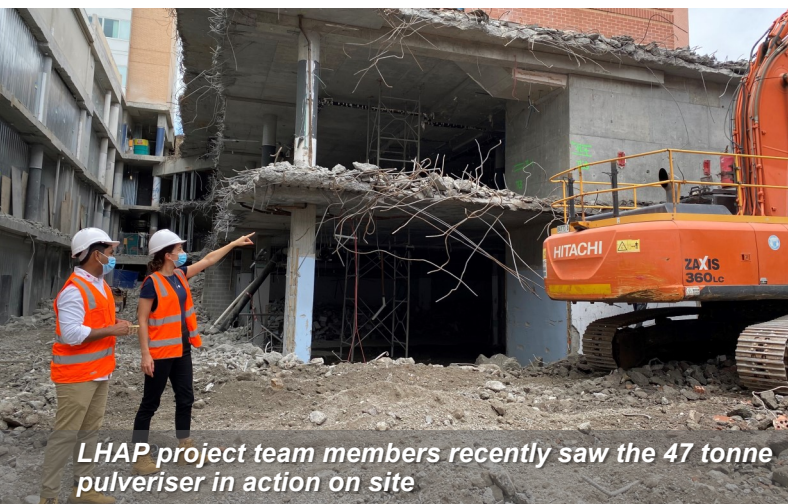
LHAP project team members recently saw the 47 tonne pulveriser in action on site

To learn more about key features of the future ED, check out our latest video at bit.ly/LHAPfutureED