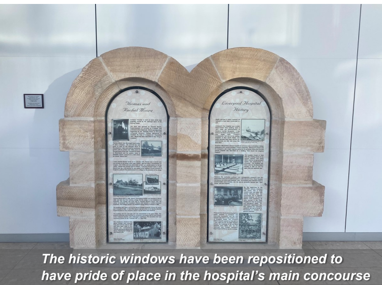
The historic windows have been repositioned to have pride of place in the hospital’s main concourse

To read more about the history of the sandstone windows, be sure to visit their new location on the ground floor of the hospital’s main concourse.