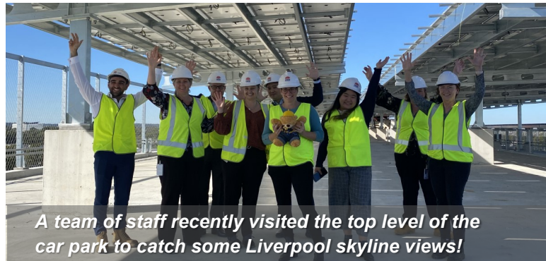
A team of staff recently visited the top level of the car park to catch some Liverpool skyline views!