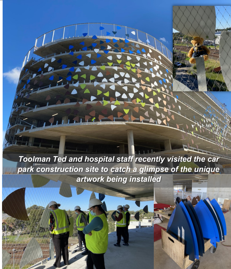
Toolman Ted and hospital staff recently visited the car park construction site to catch a glimpse of the unique artwork being installed

To learn more about the culturally inspired façade design, visit https://bit.ly/LHAPcpart