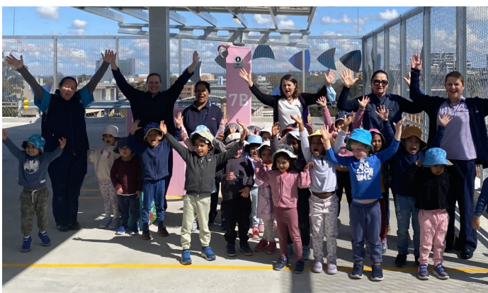
We had some excited little visitors from the hospital's childcare centre take a sneak peek of the new car park prior to its official opening.