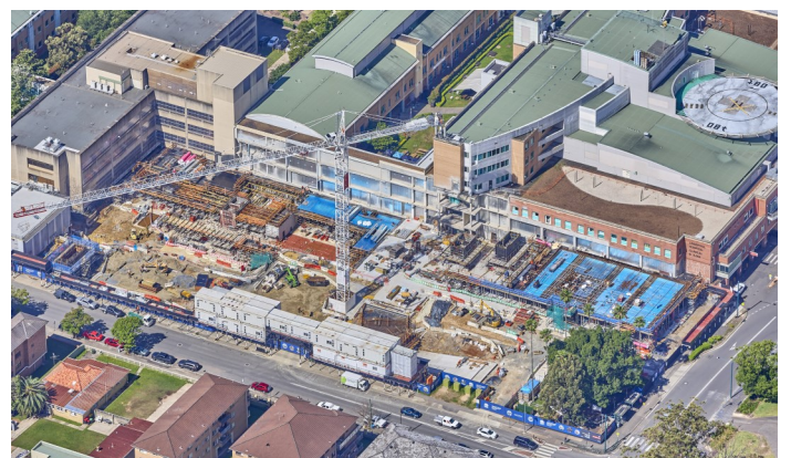
Stage 1 progress | A hospital building is taking shape which includes the Emergency Department expansion (far right corner).

THANK YOU FOR YOUR PATIENCE AS WE BUILD THE LIVERPOOL HEALTH AND ACADEMIC PRECINCT