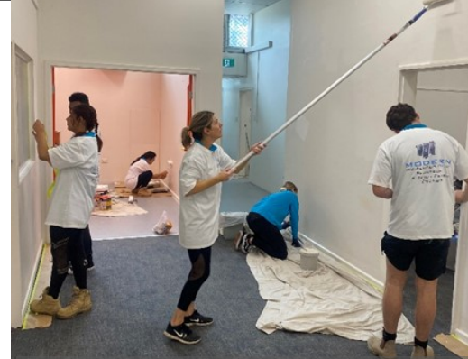
Lendlease staff freshening up a local community centre as part of Mental Health Month. Well done team!