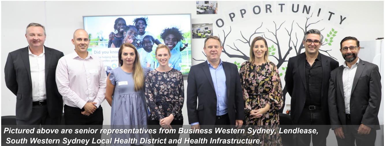
Pictured above are senior representatives from Business Western Sydney, Lendlease, South Western Sydney Local Health District and Health Infrastructure.

The Buraga Gul Skilling and Employment Hub celebrated its first anniversary last month with a joyful morning tea hosted by Lendlease. Since opening last year, the hub has provided training and support for local people aiming for a career in construction.