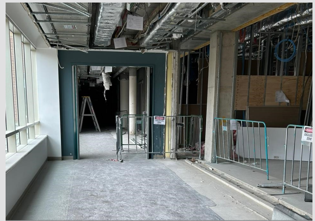
Behind-the-scenes of our builders linking the current building with the new hospital building.

To find out if this will affect you, please visit our Precinct Updates page.