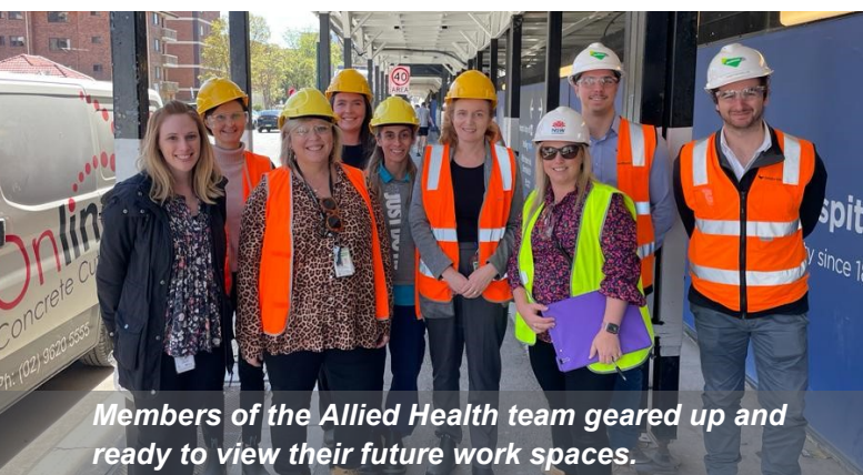
Members of the Allied Health team geared up and ready to view their future work spaces.

Each of the spaces were designed after extensive consultation with staff, community representatives, and feedback from clinicians to ensure the rooms will be fit for purpose.