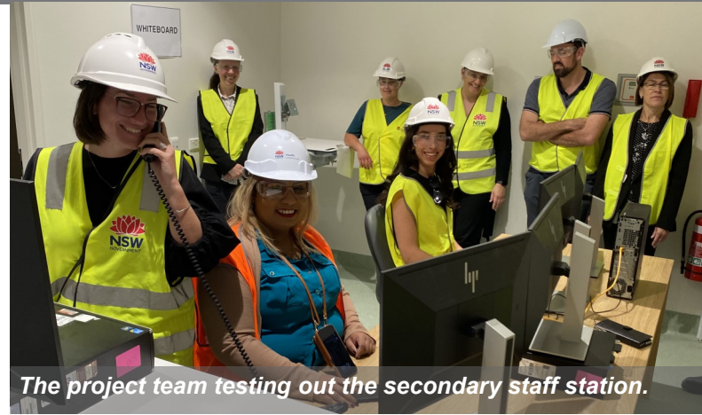
The project team testing out the secondary staff station.

“We’ve seen lots of artist impressions and plans of the future building but this is the first real opportunity for our staff to get onto the construction site, test the design and layout of their future workspaces, and ask lots of questions,” he said.