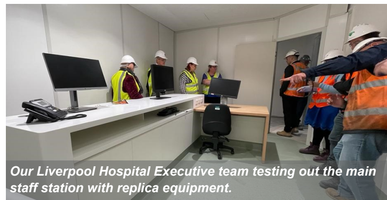
Our Liverpool Hospital Executive team testing out the main staff station with replica equipment.

“It is fantastic to see our hospital redevelopment reach this stage and our staff are so excited to experience their future workspaces and provide feedback before the final versions are built.”