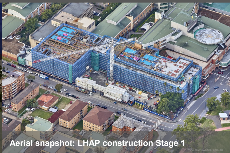
Aerial snapshot: LHAP construction Stage 1

Did you know? The solar panels installed on the new car park provide on average, enough electricity to power approximately 100 houses per day.