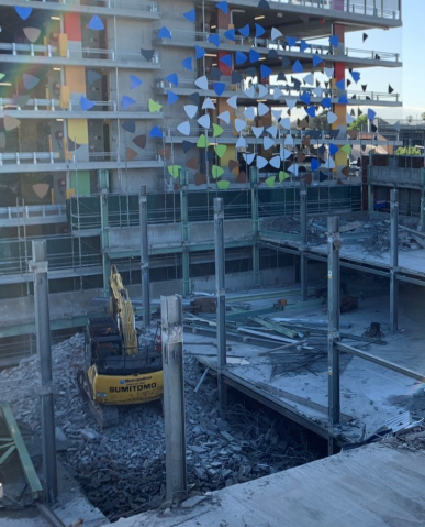
Take a look inside the current demolition zone of the former P2 car park.

🙀 The former P2 car park will develop into ground level public parking and will become an additional entrance point into the new P2 multi-storey car park.