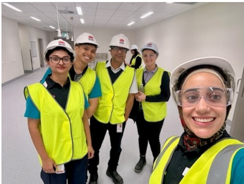
Our biomedical team are getting ready to move into their new space soon!

To see the full list of moves for all our stage 1 departments, visit our ‘Countdown to Opening’ page.