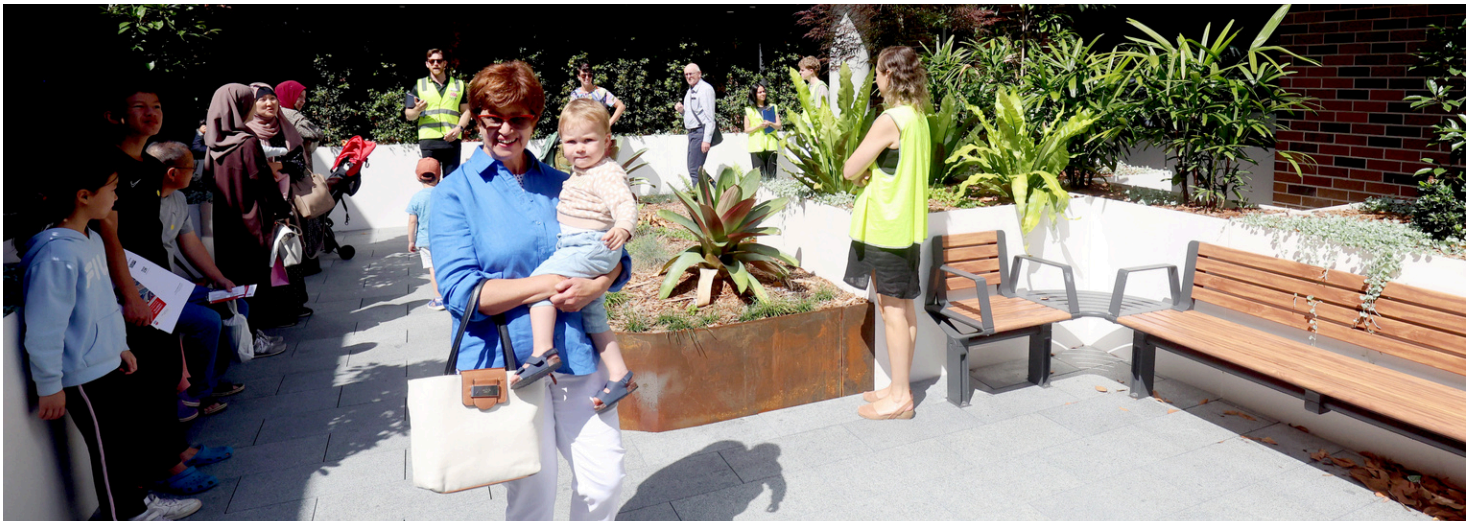
Community members visit the birthing unit courtyard during the recent Welcome All Cultures Community Open Day.

Liverpool Hospital's state-of-the-art new building has opened to the community as part of the $830 million Liverpool Health and Academic Precinct redevelopment.